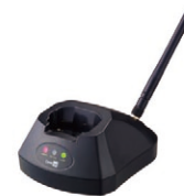
3G Cradle / GPRS Cradle (Quad Band)